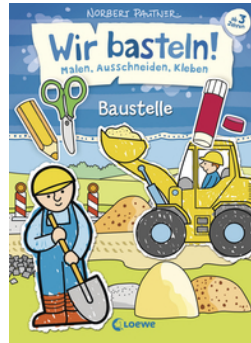
Let's Do Arts and Crafts! - Construction Site