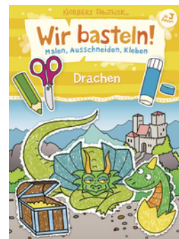
Let's Do Arts & Crafts! - Dragons