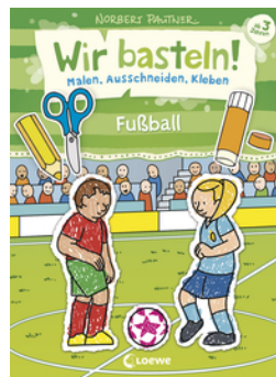
Let's Do Arts and Crafts! - Football