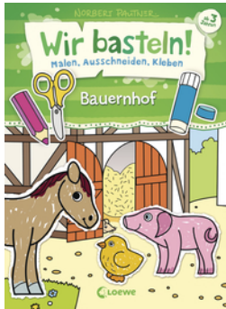
Let's Do Arts and Crafts! - Farm