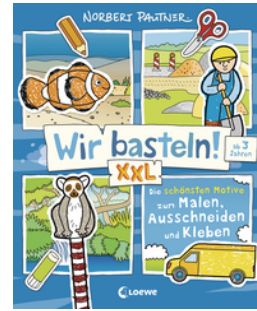
Let's Do Arts & Crafts! XXL - The most beautiful designs to paint, cut out and glue (blue)