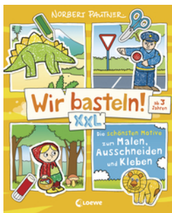
Let's do Arts and Crafts! XXL - The most beautiful designs to paint, cut out and glue (yellow)