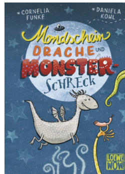
Moonshine Dragon and Monster Shock