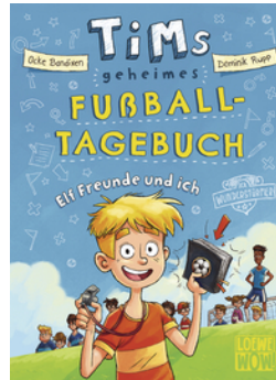
Tim's Secret Soccer Diary – 11 Friends and I (Vol.1)