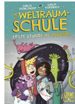
Space School – Science of Aliens (Vol. 1)