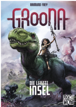
Groona – The Last Island (Vol. 1)