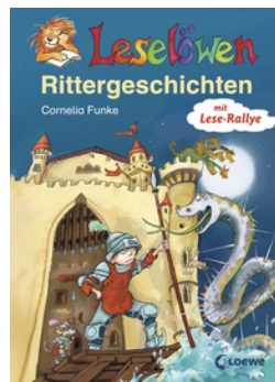
Reading Lions - Knight Stories