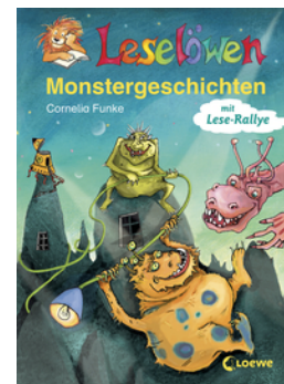
Reading Lion Monster Stories (Relaunch)