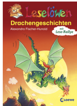
Reading Lions - Dragon Stories