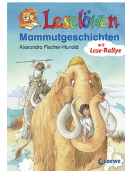
Reading Lions - Mammoth Stories