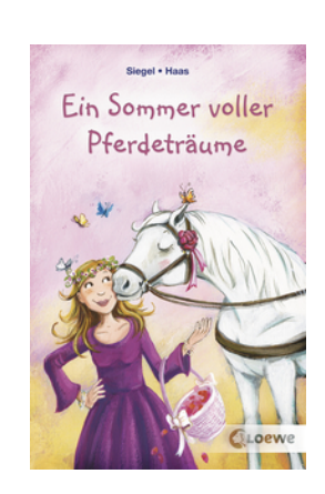
Summer Dreams About Horses