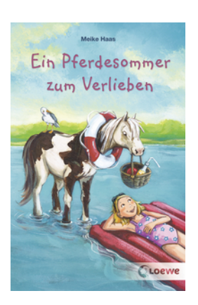
A Pony Summer to Fall In Love