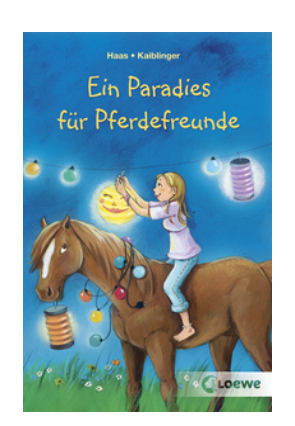
A Paradise For Horse Lovers