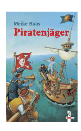
The Pirate Hunters