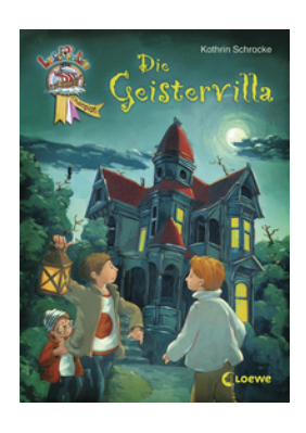
The Haunted House