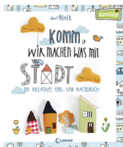
Let's Make Something in Town