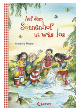
Sunny Farm – Something's up on Sunny Farm (Vol. 3)