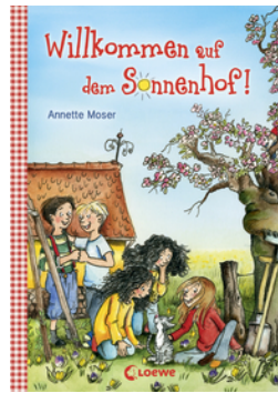
Sunny Farm – Welcome to Sunny Farm! (Vol. 1)