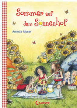
Sunny Farm – Summer on Sunny Farm (Vol. 2)