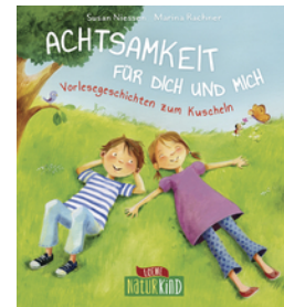
Attentiveness for All of Us! – Story Time is Cuddle Time!