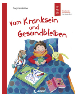
When I Get Sick: About Becoming Ill and Feeling Better