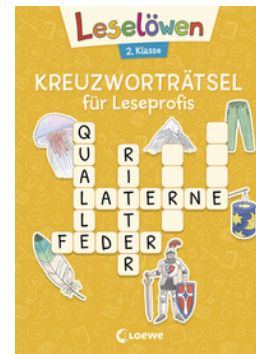
Reading Lions Crosswords for Beginning Readers - Year 2