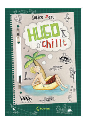
Hugo Chills (Vol. 5)