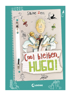
Stay Cool, Hugo! (Vol. 6)