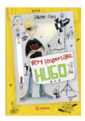
Very Important Hugo (Vol. 4)