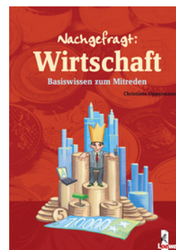
Guide to Economics