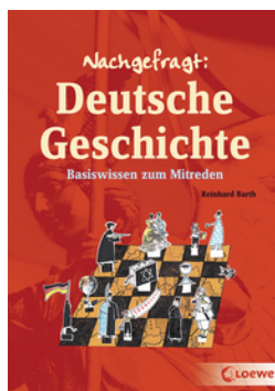
Guide to German History