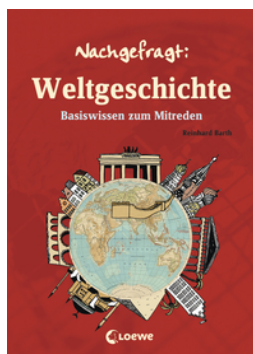
Guide to World History