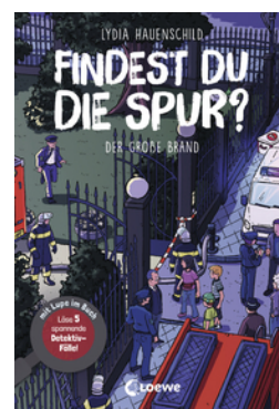
Can You Find the Clue? - The Great Fire