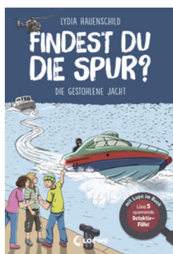
Can You Find the Clue? - The Stolen Yacht