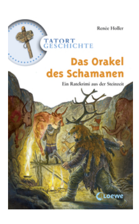
History Mysteries -The Shaman's Oracle