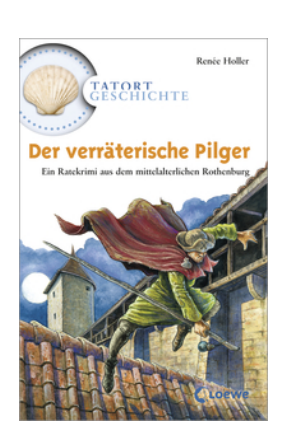
History Mysteries - The Treacherous Pilgrim