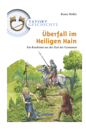
History Mysteries - Attack in the Sacred Grove