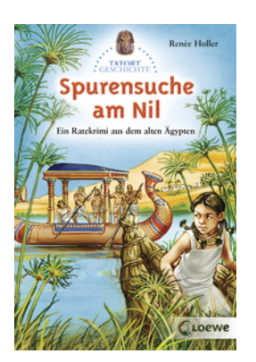
History Mysteries - Robbers on the Nile