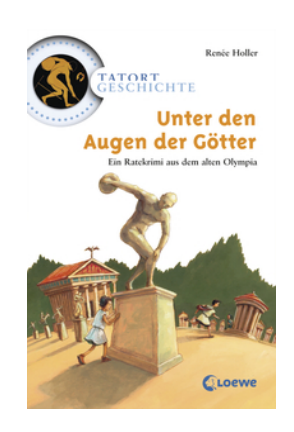
History Mysteries - Under the Eyes of the Gods