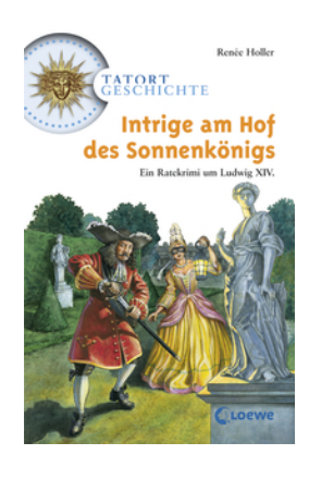
History Mysteries - Intrigue at the Sun King's Court