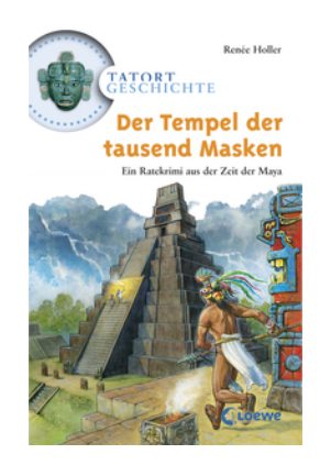
History Mysteries - The Temple of Thousand Masks