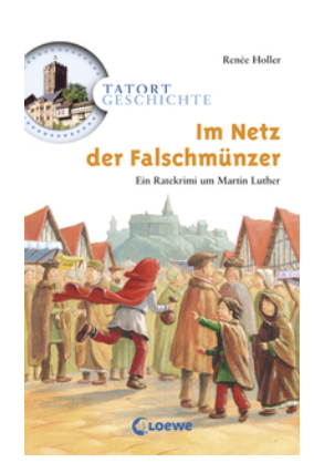
History Mysteries - Caught in the Forger's Web