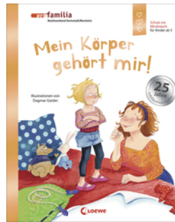
My Body Belongs to Me from My Head to My Toes - Jubilee Edition