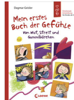
My First Book of Feelings