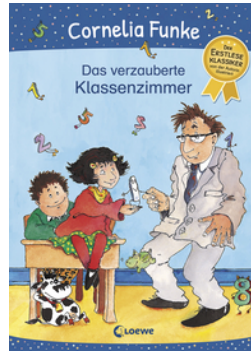
First Reading-Classic - The Enchanted Classroom