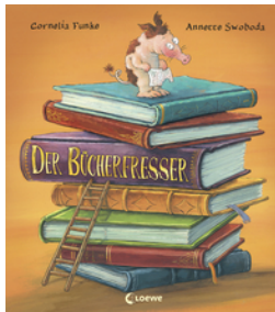
The Book Cruncher