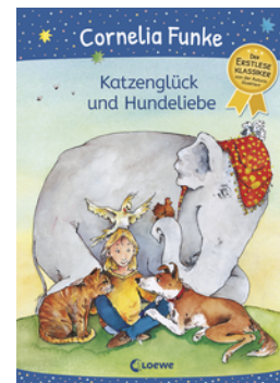
First Reading-Classic - Cat Luck and Dog Love