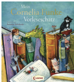
My Cornelia Funke-Reading Treasure