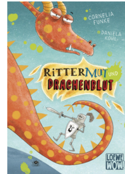
Knighthood and Dragon's Blood