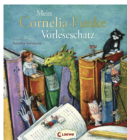
My Cornelia Funke-Reading Treasure