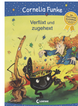
First Reading-Classic - Blessed and Bewitched