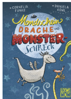
Moonshine Dragon and Monster Shock