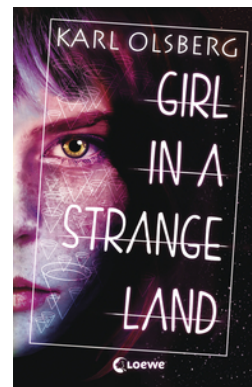
Girl in a Strange Land