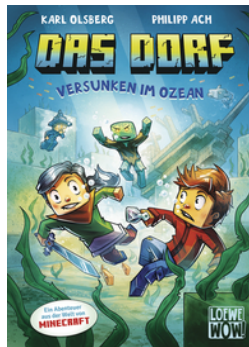
The Villagers - Sunk in the Ozean (Vol. 5)