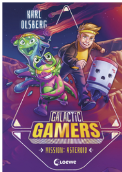
Galactic Gamers – Mission: Asteroid (Vol. 2)