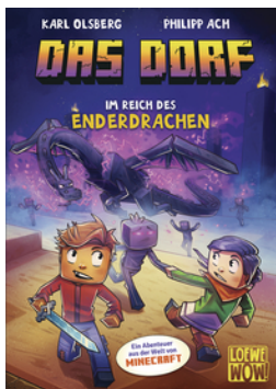
The Villagers - In the Empire of the Enderdragon (Vol. 4)