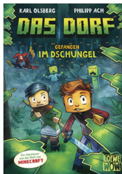
The Villagers - Trapped in the Jungle (Vol. 3)