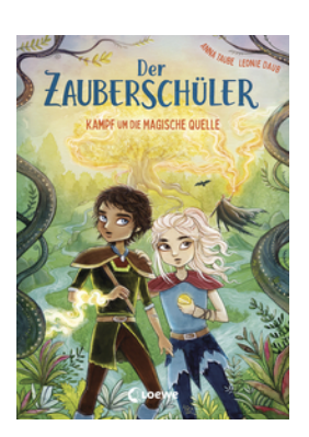
The Sorcerer's Apprentice -Battle for the Magic Spring (Vol. 4)