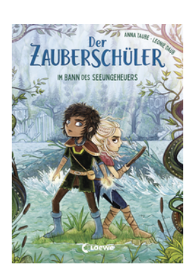
The Sorcerer's Apprentice – Under the Spell of the Sea Monster (Vol. 2)