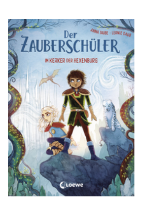
The Sorcerer's Apprentice - In the Witch Castle's Dungeon (Vol. 5)