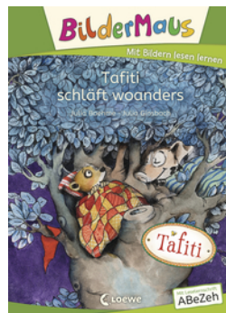
Picture Mouse - Tafiti Sleeps Somewhere Else