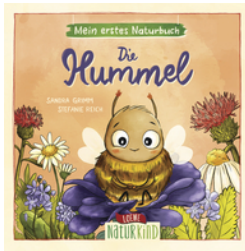
My First Naturebook – The Bumblebee