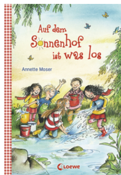
Sunny Farm – Something's up on Sunny Farm (Vol. 3)