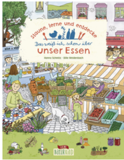
Wonder, Learn and Discover – All I Know About Our Food