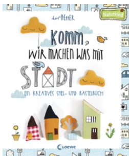
Let's Make Something in Town