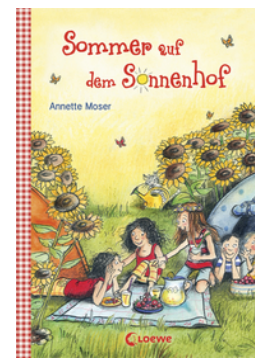
Sunny Farm – Summer on Sunny Farm (Vol. 2)