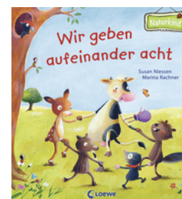
We care for each other!