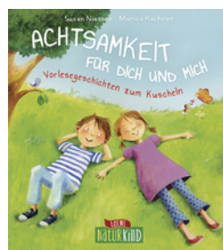
Attentiveness for All of Us! – Story Time is Cuddle Time!