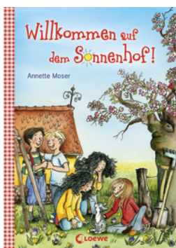
Sunny Farm – Welcome to Sunny Farm! (Vol. 1)