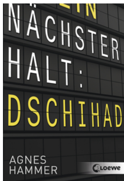
Next Stop: Jihad