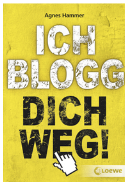
I'll Blog You Away!