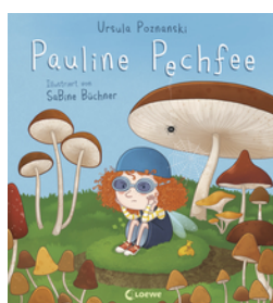
Pauline the Flop-Fairy