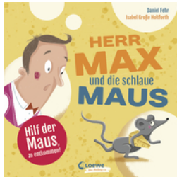
Mr. Max and the Clever Mouse