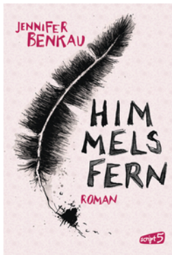
Far from Heaven