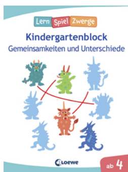
Little Quiz Dwarfs - Similarities and Differences