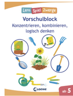
Little Quiz Dwarfs - Logic Games