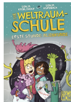
Space School – Science of Aliens (Vol. 1)