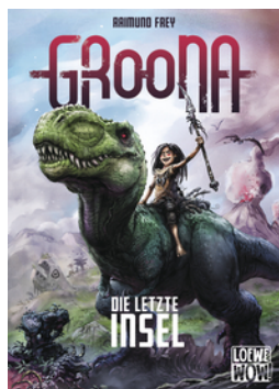
Groona – The Last Island (Vol. 1)