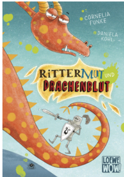
Knighthood and Dragon's Blood