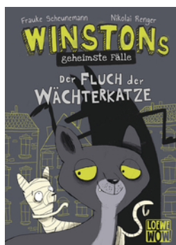
WINSTON's Cold Cases – The Curse of the Watch Cat (Vol. 1)