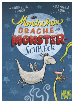
Moonshine Dragon and Monster Shock