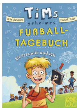
Tim's Secret Soccer Diary – 11 Friends and I (Vol.1)