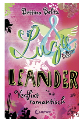
Luzie & Leander - Romantically Darned (Vol. 8)