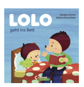
Lolo Goes to Bed