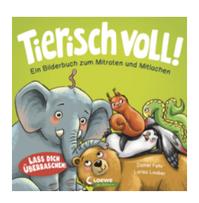
Can You Fit In The Animals?