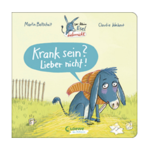
Little Donkey No-Never-Ever -Being Sick