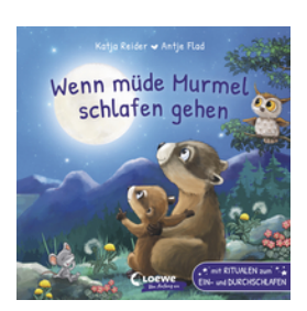
When Tired Marmots Go to Sleep