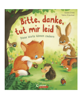
Please, Thank You, I'm Sorry!