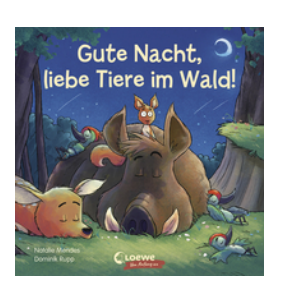
Good Night, Dear Forest Animals!