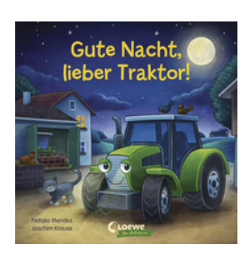
Good Night, Dear Tractor!