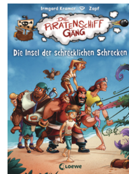
The Pirate Ship Gang – The Island of Horrible Horrors (Vol. 2)