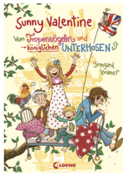
Sunny Valentine – Tropical Birds and Royal Unterpants (Vol. 1)