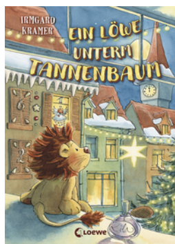
A Lion under the Christmas Tree