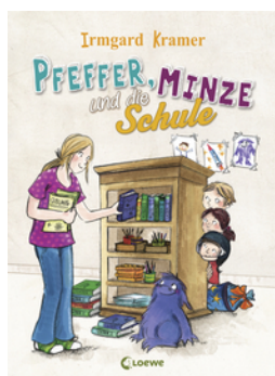
Pepper, Mint and School (Vol. 1)