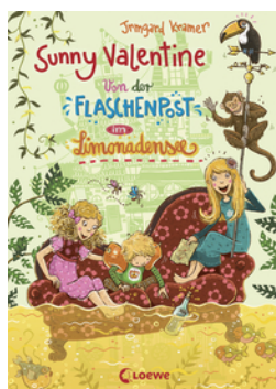
Sunny Valentine – Message in a Bottle in the Lemonade Lake (Vol. 3)