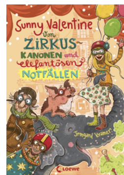
Sunny Valentine – Circus Cannons and Elephantine Emergencies (Vol. 4)