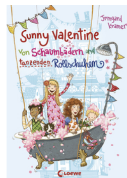
Sunny Valentine – Foam Baths and Dancing Roller-Skates (Vol. 2)