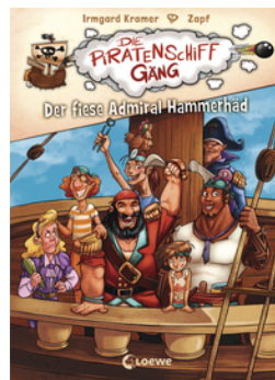
The Pirate Ship Gang – The Abominable Admiral Hammerhead (Vol. 1)