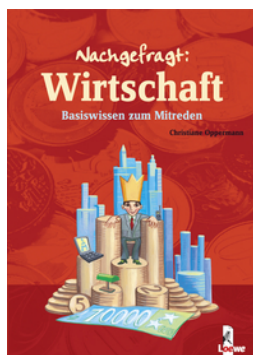
Guide to Economics