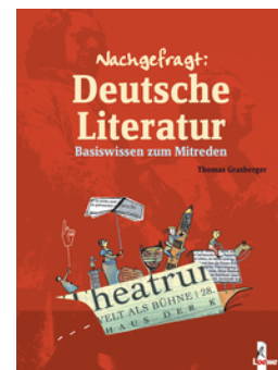
Guide to German Literature