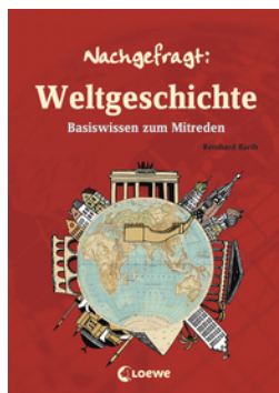
Guide to World History