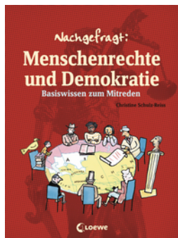
Guide to Human Rights and Democracy