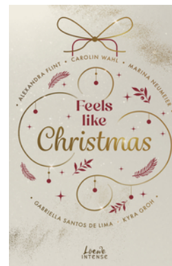
Feels Like Christmas