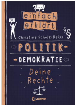
Simply Explained – Politics, Democracy, Your Rights