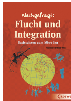
Guide to Refugee Migration and Integration