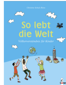
How The World Lives