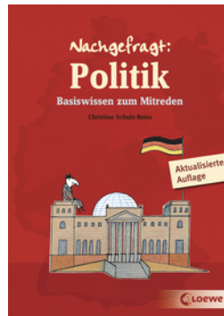
Guide to Politics