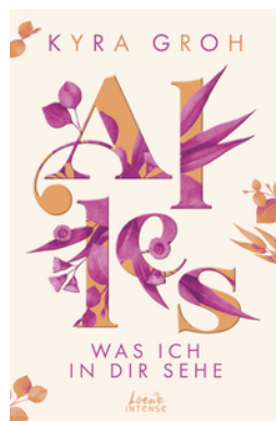
All That I See In You