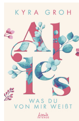
All That You Know About Me