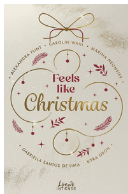
Feels Like Christmas