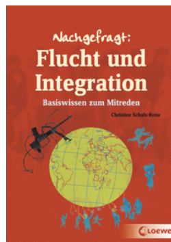
Guide to Refugee Migration and Integration