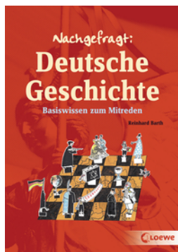
Guide to German History