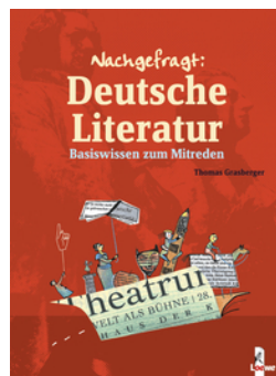
Guide to German Literature