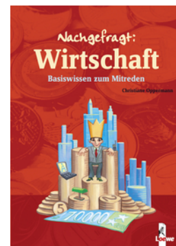
Guide to Economics