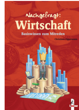
Guide to Economics