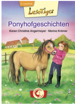
Pony Farm Stories