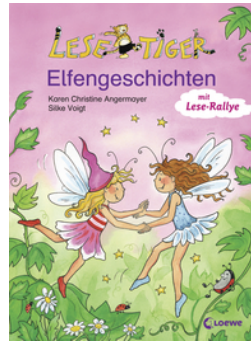
Reading Tiger Fairy Stories