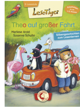
Theo's Big Trip