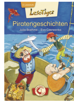
Reading Tiger - Pirate Stories