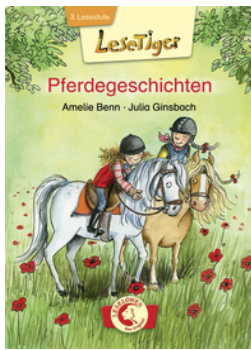
Reading Tiger - Horse Tales