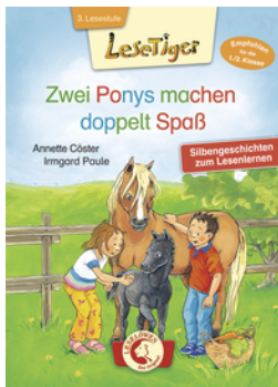
Reading Tiger: Two Ponies are Twice the Fun