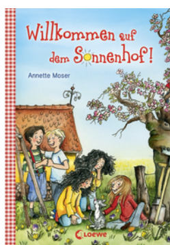
Sunny Farm – Welcome to Sunny Farm! (Vol. 1)