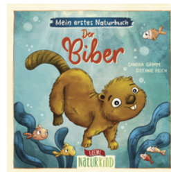
My First Naturebook – The Beaver