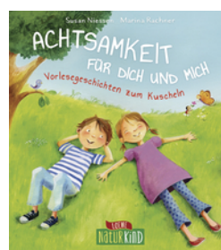
Attentiveness for All of Us! – Story Time is Cuddle Time!