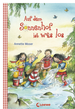
Sunny Farm – Something's up on Sunny Farm (Vol. 3)