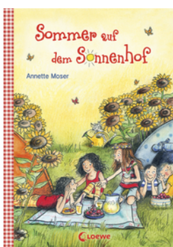
Sunny Farm – Summer on Sunny Farm (Vol. 2)