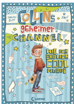
Collin's Secret Channel - How I Finally Became a Cool Guy (Vol. 1)