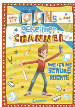
Collin - How I Rocked School (Vol. 2)