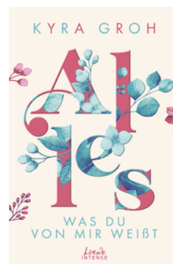
All That You Know About Me