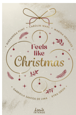
Feels Like Christmas