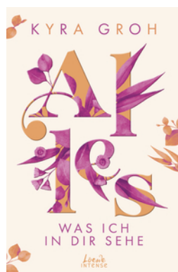
All That I See In You