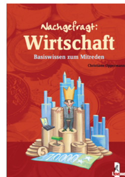
Guide to Economics