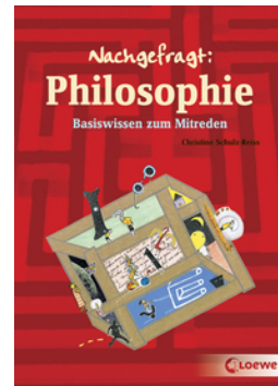
Guide to Philosophy