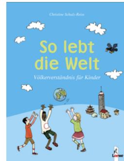
How The World Lives