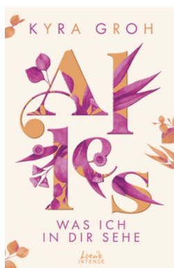
All That I See In You