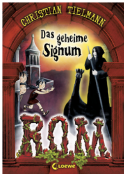
R.O.M. - The Secret Signum (Vol. 2)