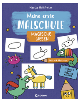
My First Drawing School - Magical Creatures