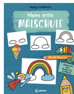
My First Drawing School