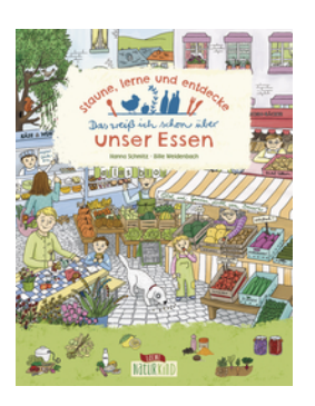
Wonder, Learn and Discover – All I Know About Our Food