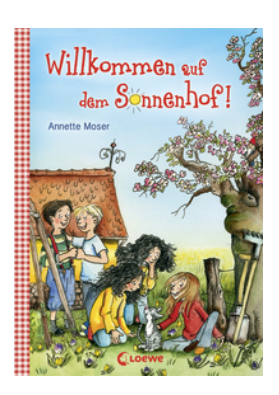
Sunny Farm – Welcome to Sunny Farm! (Vol. 1)