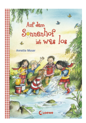
Sunny Farm – Something's up on Sunny Farm (Vol. 3)