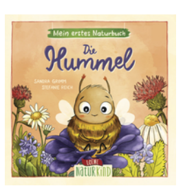
My First NaturebookThe Bumblebee