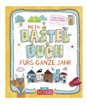
My Craft Book for the Whole Year