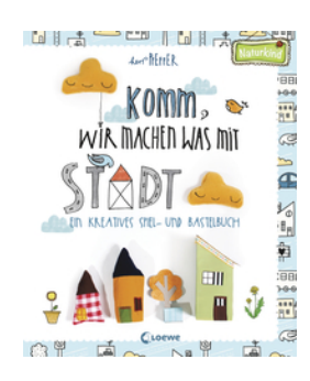
Let's Make Something in Town