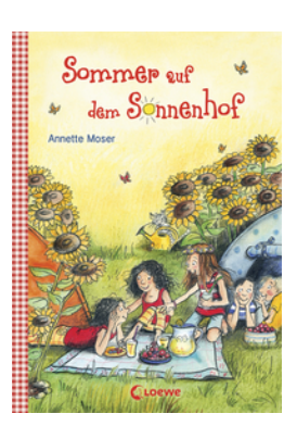
Sunny Farm – Summer on Sunny Farm (Vol. 2)