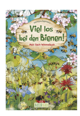
Let's Go Explore the Bees! -My non-fiction Search and Find book