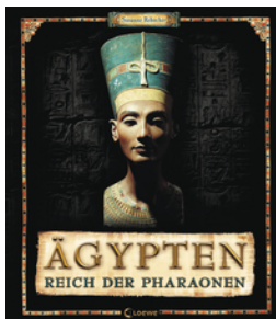
Ancient Egypt – Empire of the Pharaohs