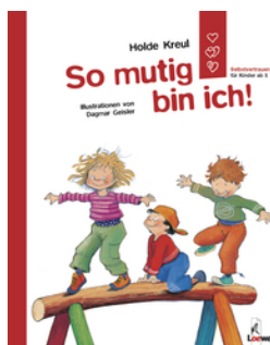
I Can Be Brave - Overcoming Fear, Finding Confidence, and Asserting Yourself