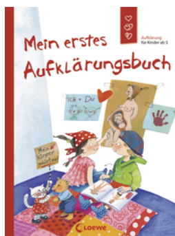
My First Book of Sexual Education