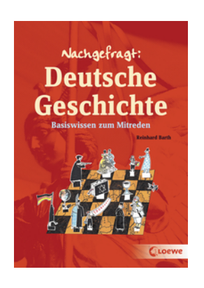
Guide to German History