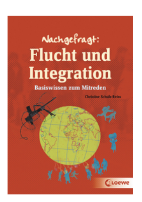
Guide to Refugee Migration and Integration