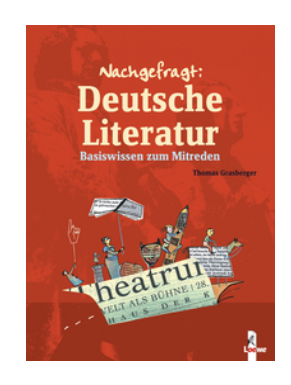
Guide to German Literature