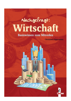
Guide to Economics