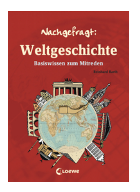
Guide to World History