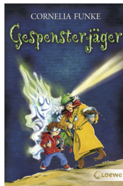
Ghosthunters (bind-up paperback)