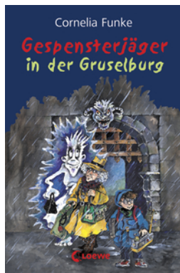
Ghosthunters and the Totally Moldy Baroness