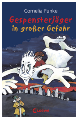
Ghosthunters and the Muddy Monster of Doom