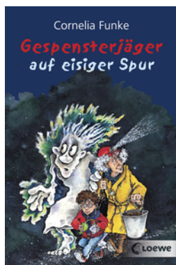
Ghosthunters on Icy Trails