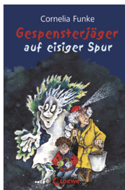
Ghost Hunters and the Incredibly Revolting Ghost