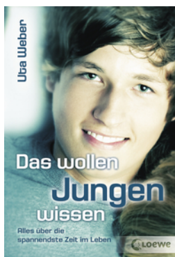
All Boys Want to Know – Facts about the Most Exciting Time of Life