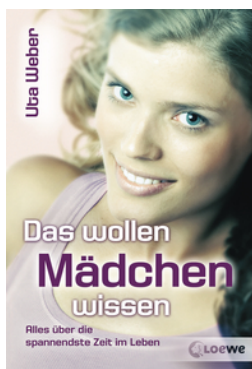
All Girls Want to Know – Facts about the Most Exciting Time of Life