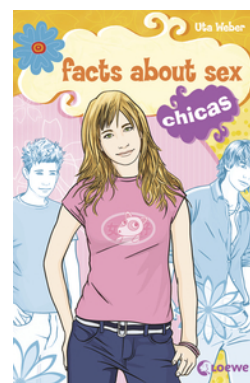
Facts About Sex - Chicas