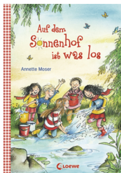
Sunny Farm – Something's up on Sunny Farm (Vol. 3)