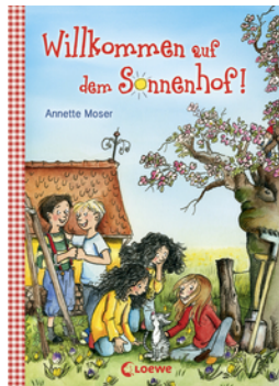
Sunny Farm – Welcome to Sunny Farm! (Vol. 1)