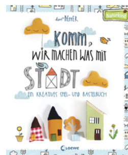
Let's Make Something in Town