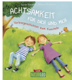
Attentiveness for All of Us! – Story Time is Cuddle Time!