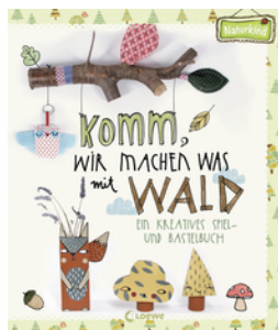
Let's Make Something with Wood