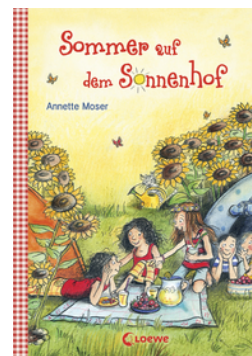
Sunny Farm – Summer on Sunny Farm (Vol. 2)