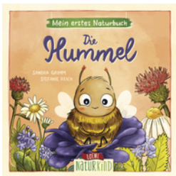
My First Naturebook – The Bumblebee