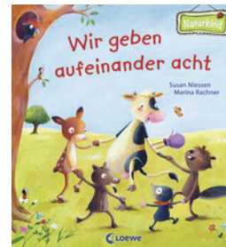
We care for each other!